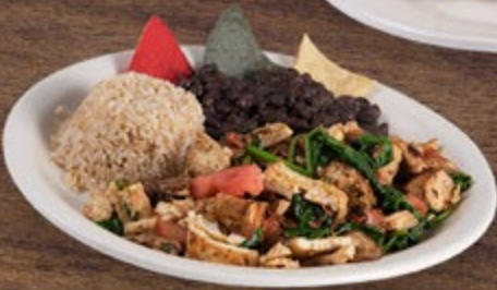
POWER BREAKFAST SCRAMBLE - $13 Five egg whites scrambled with tomatoes, mushrooms, chicken and spinach. Served with black beans, brown rice & tortilla.