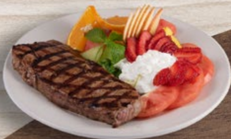
NEW YORK STEAK - $19