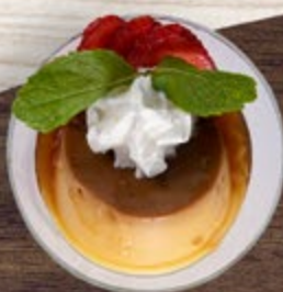
FLAN - $5