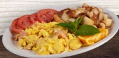
LOX SCRAMBLE - $18 Smoked salmon scrambled with onions. Served with plain or onion bagel.