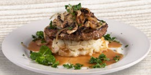
GROUND SIRLOIN STEAK - $15 Charbroiled ground sirloin topped with sautéed mushrooms & onions. Served over mashed potatoes with gravy.