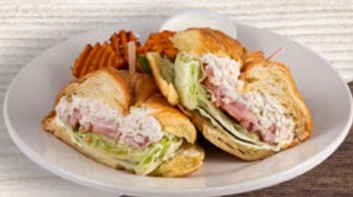
CHICKEN OR TUNA SALAD CROISSANT - $13 Fresh chicken or tuna salad with lettuce, tomatoes.