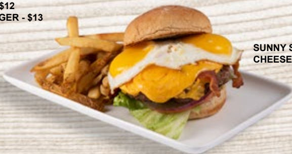
SUNNY SIDE BACON CHEESE BURGER - $14

HAMBURGER - $11 AMERICAN CHEESE BURGER - $12 AVOCADO CHEESE BURGER - $13 BACON CHEESE BURGER - $13 BACON AVOCADO CHEESE BURGER - $14 VEGGIE BURGER - $12 BLEU CHEESE BURGER - $13