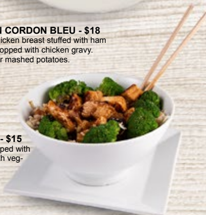
TERIYAKI CHICKEN - $15 Grilled chicken breast topped with teriyaki sauce. Served with vegetables over brown rice.