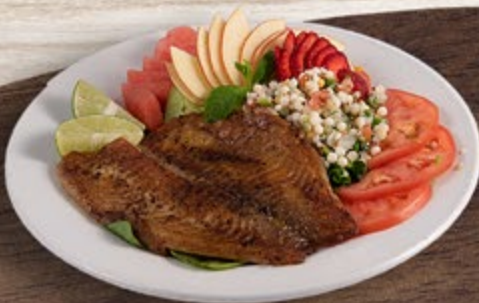
TILAPIA FILET - $15