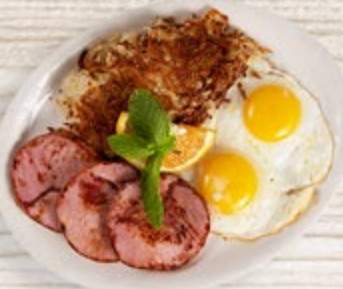
CANADIAN BACON - $14