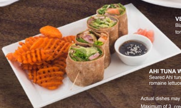
AHI TUNA WRAP - $15 Seared Ahi tuna with romaine lettuce, avocado.

Actual dishes may vary slightly from the pictures Maximum of 3 credit card transactions per table