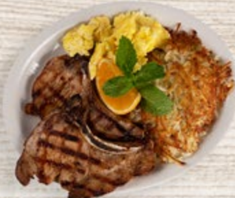
BROILED PORK CHOPS - $18

Choice of seasonal fresh fruit or potatoes. Substitute bagel & cream cheese for toast, add $1. Substitute egg whites, add $1)