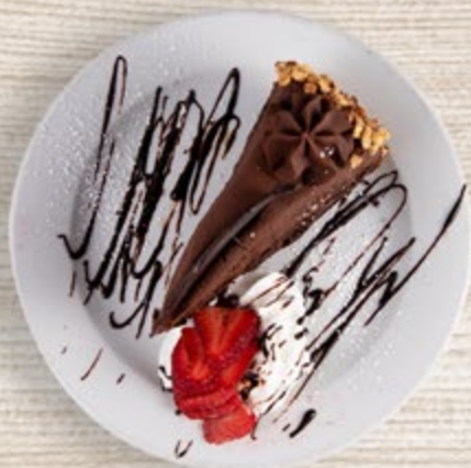
CHOCOLATE CAKE - $7