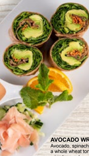
AVOCADO WRAP - $10 Avocado, spinach and carrots in a whole wheat tortilla, side of siracha ranch.