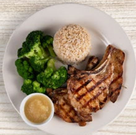
PORK CHOPS - $19 Two broiled pork chops served with vegetables. Choice of brown rice or mashed potatoes with gravy & a side of apple sauce.