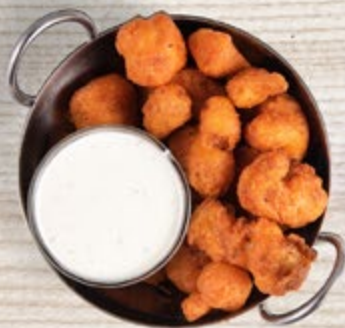
SPICY CAULIFLOWER - $11 W/ dipping sauce