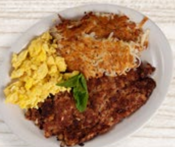
CORNERD BEEF HASH - $13