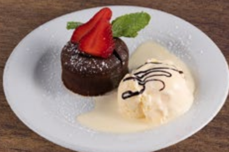
CHOCOLATE BROWNIE A LA MODE - $8