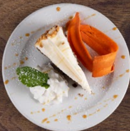
CARROT CAKE - $7