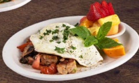
POWER OMELETTE - $13 Fluffy egg white omelette with chicken, tomatoes & mushrooms (no cheese). Served with fresh fruit.