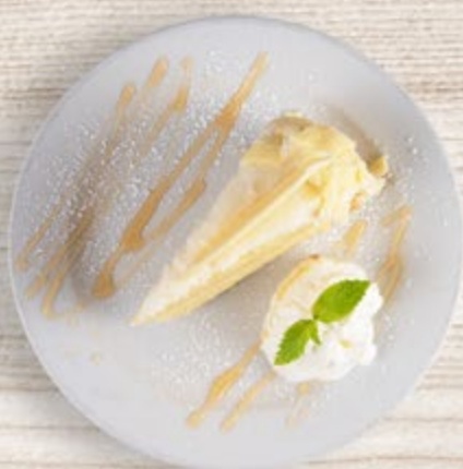
LEMON CAKE - $7