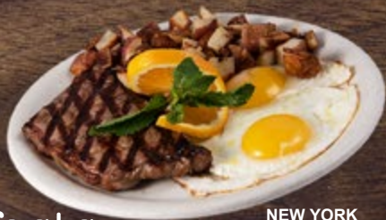
NEW YORK STEAK - $19