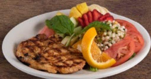
GRILLED CHICKEN BREAST - $14