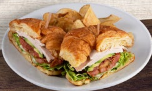
CLUB CROISSANT - $14 Fresh roasted turkey slices, bacon, lettuce, tomatoes, avocado & mayo.