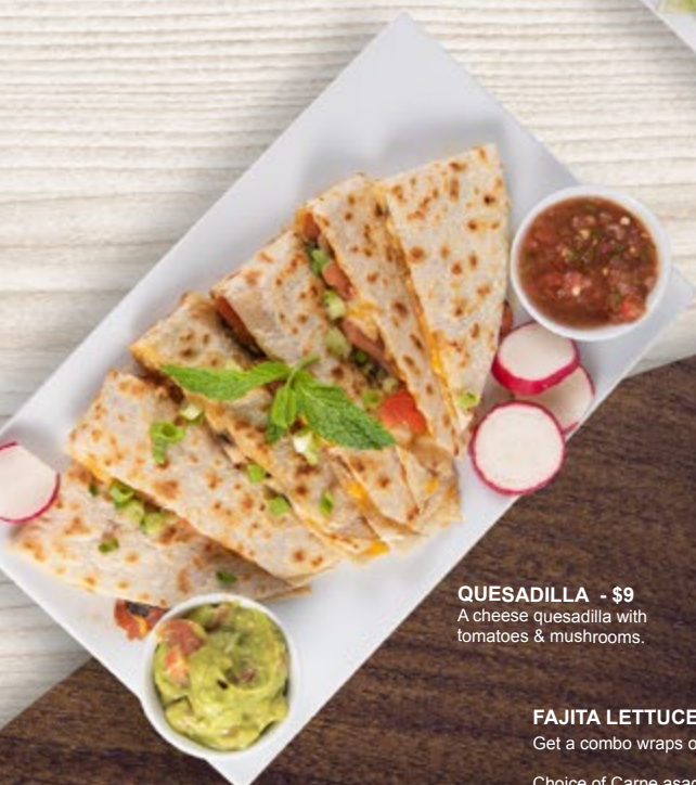
QUESADILLA - $9 A cheese quesadilla with tomatoes & mushrooms.