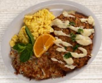
CHICKEN FRIED STEAK & EGGS - $16