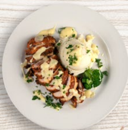
CHICKEN CORDON BLEU - $18 Breaded chicken breast stuffed with ham & cheese, topped with chicken gravy. Served over mashed potatoes.