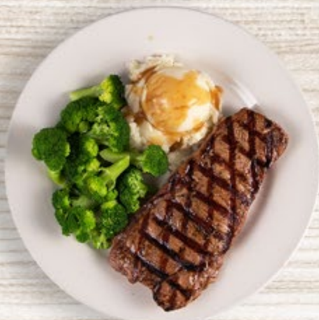
NEW YORK STEAK - $19 Choice of mashed potatoes or brown rice and market vegetables.

(Served with homemade soup or house salad.)