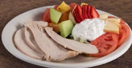
FRESH ROASTED TURKEY - $14