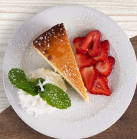
CHEESECAKE - $7