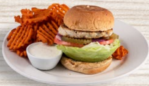
TURKEY BURGER - $13

HAMBURGER - $11 AMERICAN CHEESE BURGER - $12 AVOCADO CHEESE BURGER - $13 BACON CHEESE BURGER - $13 BACON AVOCADO CHEESE BURGER - $14 VEGGIE BURGER - $12 BLEU CHEESE BURGER - $13