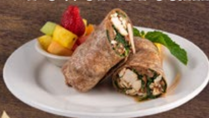
POWER WRAP - $13 Five egg whites scrambled with grilled chicken, sautéed spinach, mushrooms, tomatoes wrapped in a whole wheat tortilla. Served with fresh fruit.