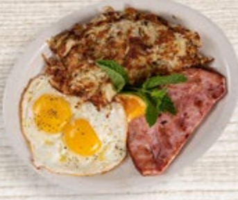
HAM STEAK - $14