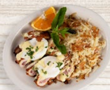
EGGS CORDON BLEU - $18 Breaded chicken breast stuffed with ham & cheese topped with two poached eggs and hollandaise sauce.