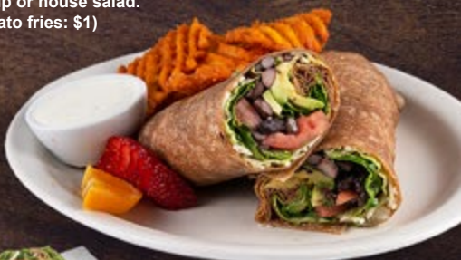
VEGGIE WRAP - $12 Black beans with romaine lettuce, tomatoes, avocado & cheese.